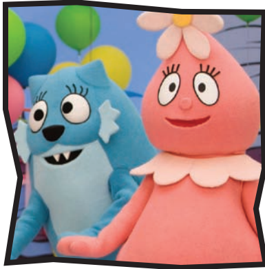
'Yo Gabba Gabba' Is a Huge Hit with Kids!