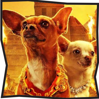
The Movie Monster Reviews 'Beverly Hills Chihuahua'